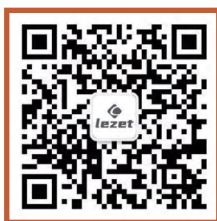
公众号 WeChat Official Account