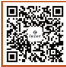
公众号 WeChat Official Account